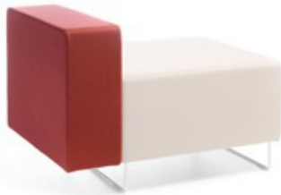
QD P690 + QD P1R