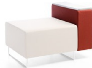
QD P690 + QD P1L B