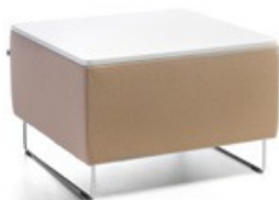
QD T690B Tischplatte - Melamin